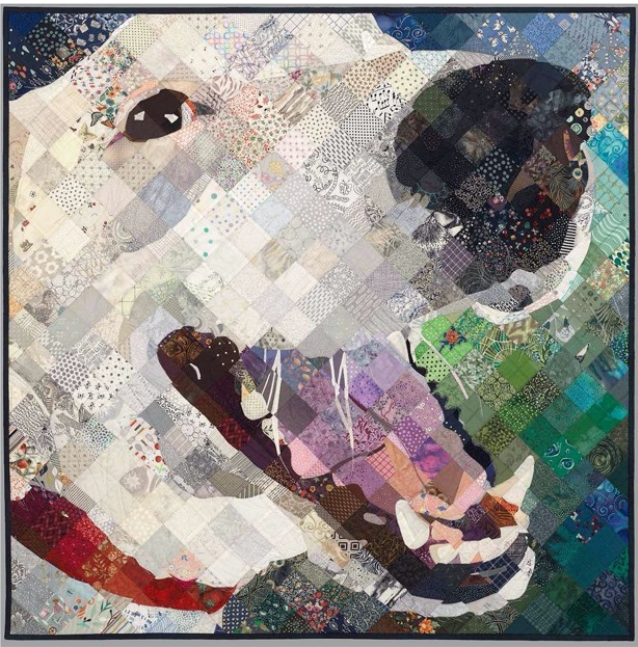
Lady Teela of Amherst (38" x 38") by Timna

Her own work is chiefly about color, in relatively small-format compositions. What keeps her engaged is watching how her projects change and transform with the addition of each color and texture.