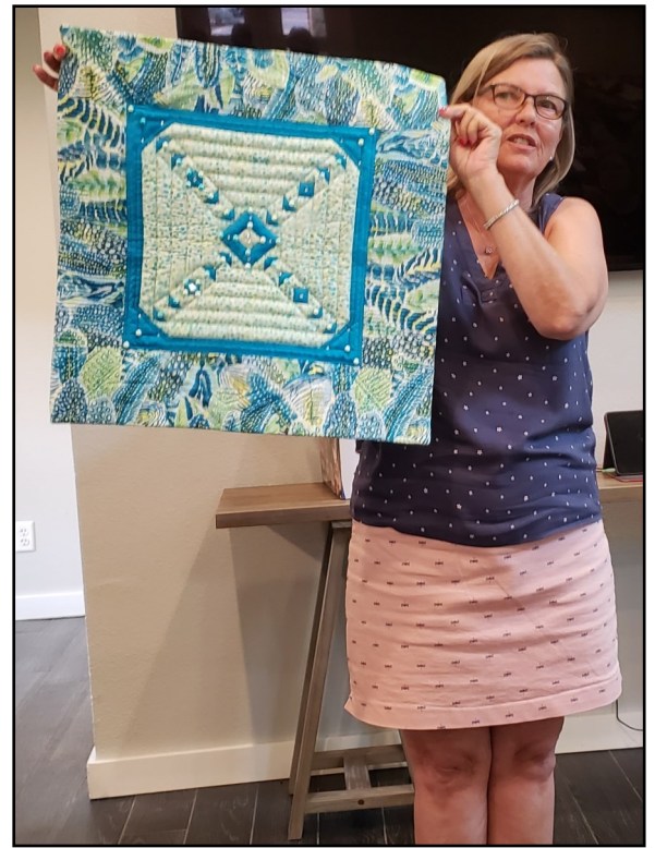
Deborah Kay Back to Basics Log Cabin Quilt with pearls and diamonds made for quilt show auction